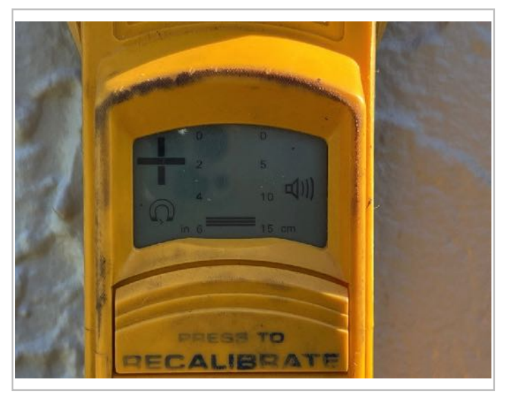
100% reinforced masonry